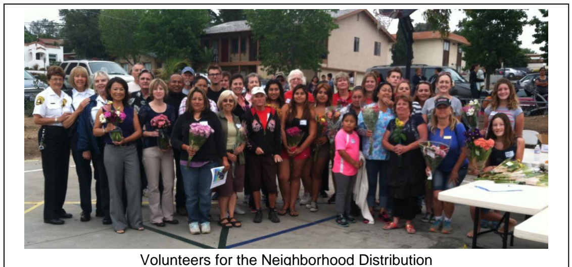
Volunteers for the Neighborhood Distribution