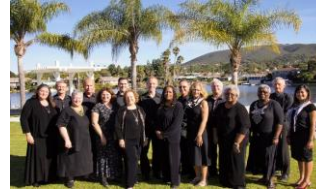
Through The Storm Choir