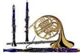
Palomar Woodwind Quintet