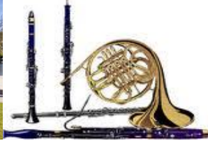
Palomar Woodwind Quintet