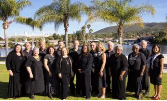
Through The Storm Choir

A benefit concert for the Fallbrook Food Pantry Time: 3:00-4:30pm Location: Fallbrook United Methodist Church 1844 Winterhaven Road (at Green Canyon)